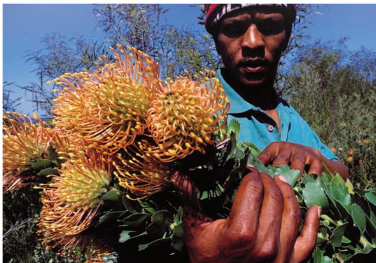
Fig. 2. A flower collector in Flower Valley, South Africa, harvesting pincushions ( Leucospermum spp.) as part of a sustainable use initiative. Sales of sustainably harvested wild fynbos flower bouquets help to subsidize the conservation costs of the site.

Despite these efforts, biodiversity loss is not slowing down. Recent assessment shows a continued, steady overall decline in wild species' population