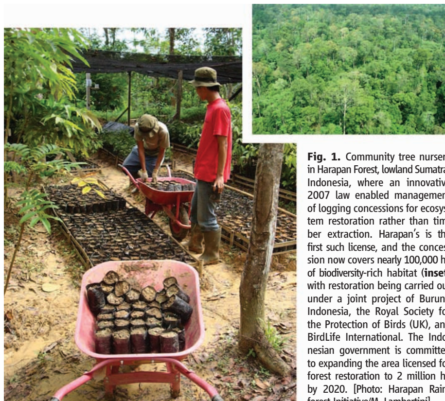
Fig. 1. Community tree nursery in Harapan Forest, lowland Sumatra, Indonesia, where an innovative 2007 law enabled management of logging concessions for ecosystem restoration rather than timber extraction. Harapan's is the first such license, and the concession now covers nearly 100,000 ha of biodiversity-rich habitat (inset) with restoration being carried out under a joint project of Burung Indonesia, the Royal Society for the Protection of Birds (UK), and BirdLife International. The Indonesian government is committed to expanding the area licensed for forest restoration to 2 million ha by 2020.

Yet biodiversity continues to decline, even though worldwide conservation efforts are increasing (1, 7, 12). In this article we review the scope and achievements of these efforts, and outline the key challenges that we believe must be