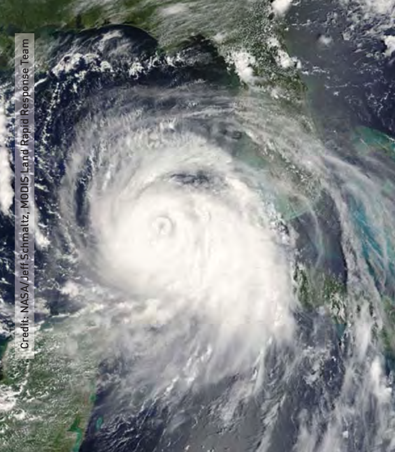
Satellite image of Hurricane Katrina, which has cost the south-eastern US billions of dollars. Damages from extreme weather events are increasing with climate change.