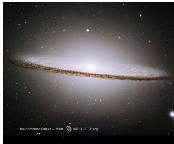
Sombrero Galaxy as seen by the Hubble Space Telescope Name: NGC 4594 (= 33) at 30.9 million lightyears distance