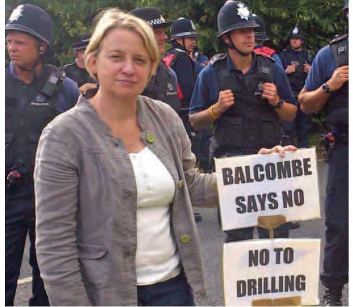
Natalie Bennett, Leader of the Green Party, demonstrates against fracking at Balcombe.

The Green Party has long led the way in protecting the climate. We have long argued that we need to build a low carbon, renewably powered society. We have always understood that solving the climate crisis is a question of economic policy, housing policy, energy policy, transport policy: it is about changing the system that puts profit before the planet. As long as a wealthy few can gain by plundering the earth's resources, they will continue to do so. Our world is interconnected, and so you will find our solutions to the climate crisis in every section of this manifesto. But the challenge also demands specific policies and frameworks. Across Europe and in the EU, Green Parties have had remarkable success in securing these.